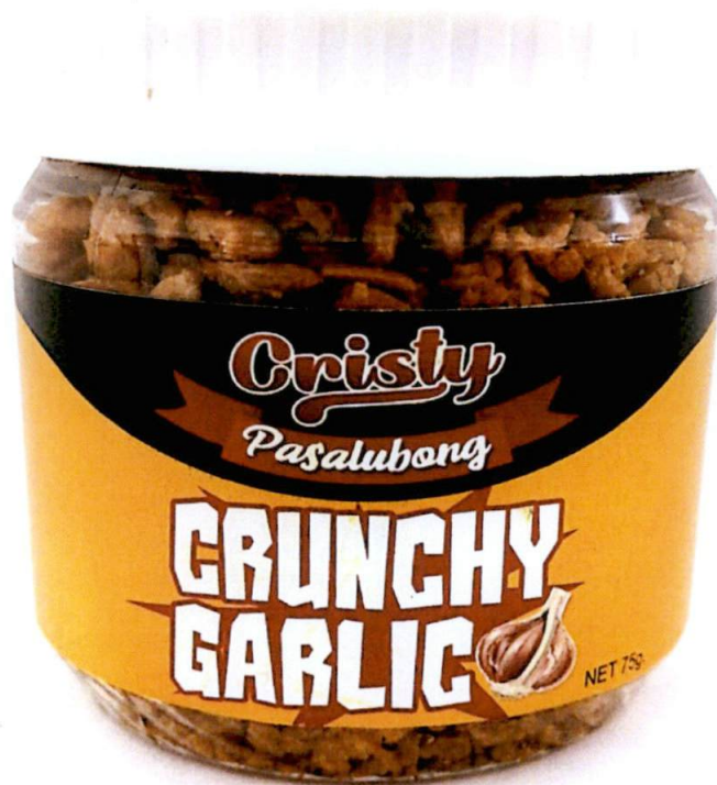
Figure 1. Unregistered CRISTY PASALUBONG Crunchy Garlic

The Food and Drug Administration (FDA) warns all healthcare professionals and the general public NOT TO PURCHASE AND CONSUME the unregistered food product: