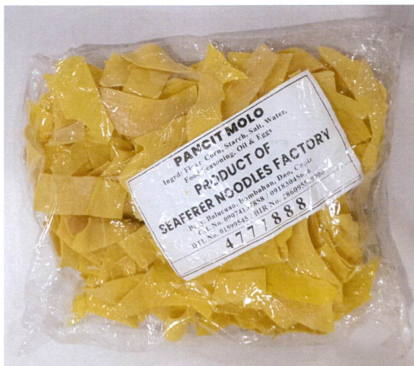
Figure 1. Unregistered UNBRANDED Pancit Molo

The Food and Drug Administration (FDA) warns all healthcare professionals and the general public NOT TO PURCHASE AND CONSUME the unregistered food product: