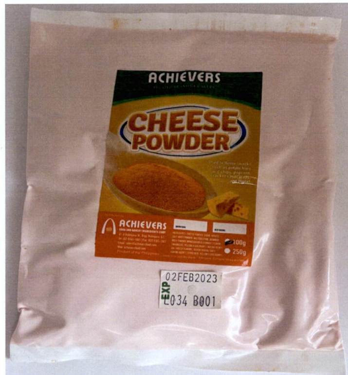
Figure 1. Unregistered ACHIEVERS Cheese Powder

The Food and Drug Administration (FDA) warns all healthcare professionals and the general public NOT TO PURCHASE AND CONSUME the unregistered food product: