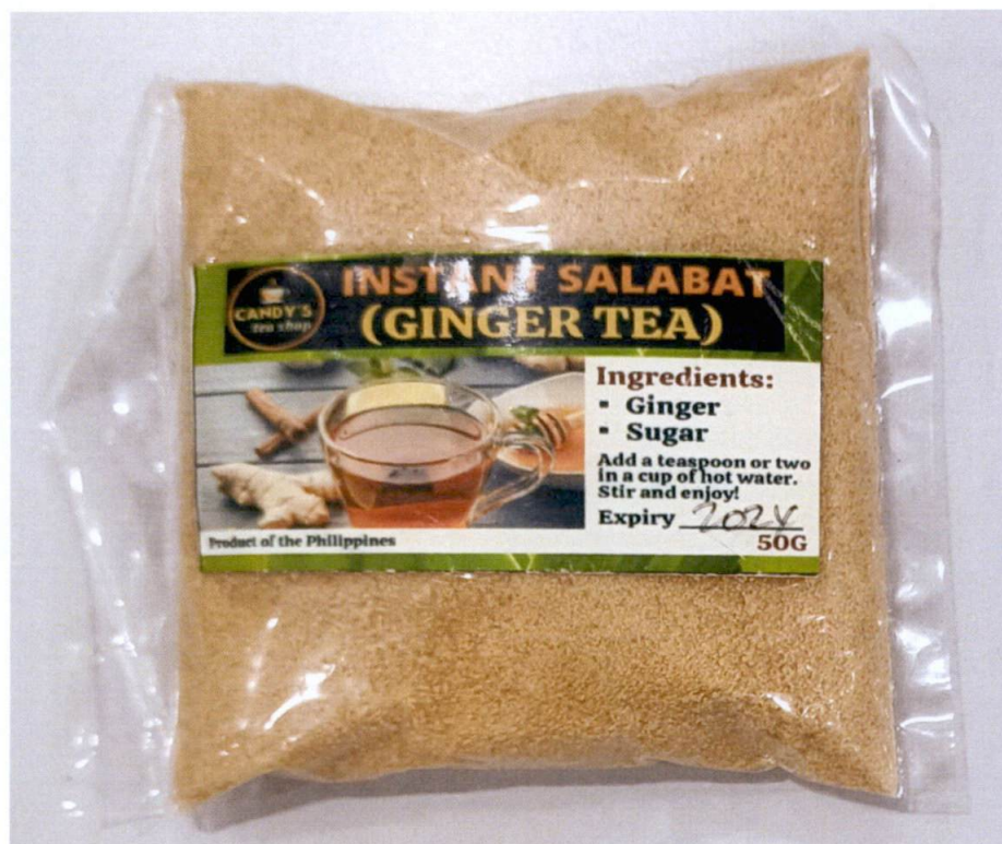
Figure 1. Unregistered CANDY'S TEA SHOP Instant Salabat (Ginger Tea)

The Food and Drug Administration (FDA) warns all healthcare professionals and the general public NOT TO PURCHASE AND CONSUME the unregistered food product: