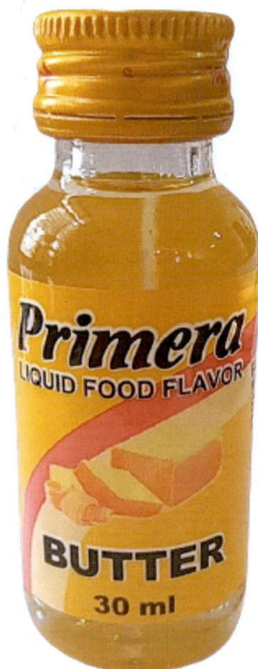
Figure 1. Unregistered PRIMERA Liquid Food Flavor Butter

The Food and Drug Administration (FDA) warns all healthcare professionals and the general public NOT TO PURCHASE AND CONSUME the unregistered food product: