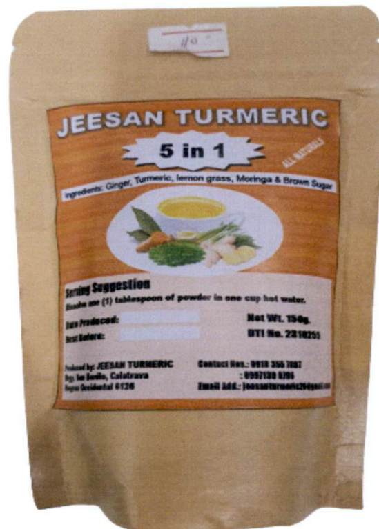
Figure 1. Unregistered JEESAN Turmeric 5 in 1

The Food and Drug Administration (FDA) warns all healthcare professionals and the general public NOT TO PURCHASE AND CONSUME the unregistered food product: