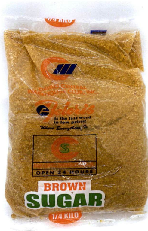
Figure 1. Unregistered FELCRIS Brown Sugar

The Food and Drug Administration (FDA) warns all healthcare professionals and the general public NOT TO PURCHASE AND CONSUME the unregistered food product: