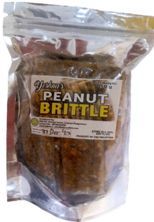
Figure 1. Unregistered YESHUA'S Peanut Brittle

The Food and Drug Administration (FDA) warns all healthcare professionals and the general public NOT TO PURCHASE AND CONSUME the unregistered food product: