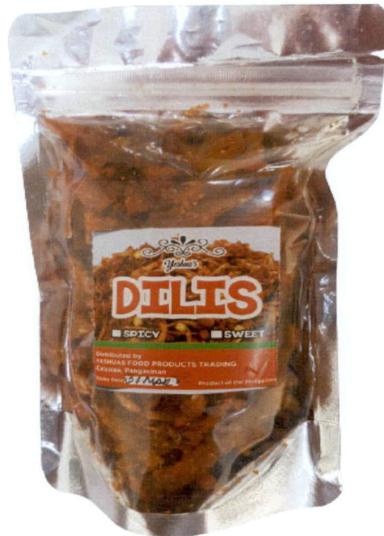
Figure 1. Unregistered YESHUA'S Dilis

The Food and Drug Administration (FDA) warns all healthcare professionals and the general public NOT TO PURCHASE AND CONSUME the unregistered food product: