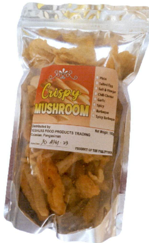
Figure 1. Unregistered UNBRANDED Crispy Mushroom

The Food and Drug Administration (FDA) warns all healthcare professionals and the general public NOT TO PURCHASE AND CONSUME the unregistered food product: