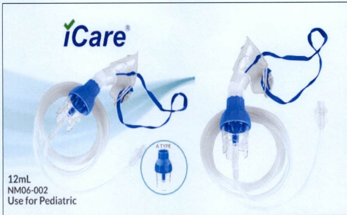
Figure 2. Unregistered iCare® Nebulizer Kit with Pediatric Aerosol Mask (NM06-002-002, 12mL)

The FDA verified through post-marketing surveillance that the abovementioned medical device product is not registered and no corresponding Product Registration Certificate has been issued. Pursuant to the Republic Act No. 9711, otherwise known as the “Food and Drug Administration Act of 2009”, the manufacture, importation, exportation, sale, offering for sale, distribution, transfer, non-consumer use, promotion, advertising or sponsorship of health products without the proper authorization is prohibited.