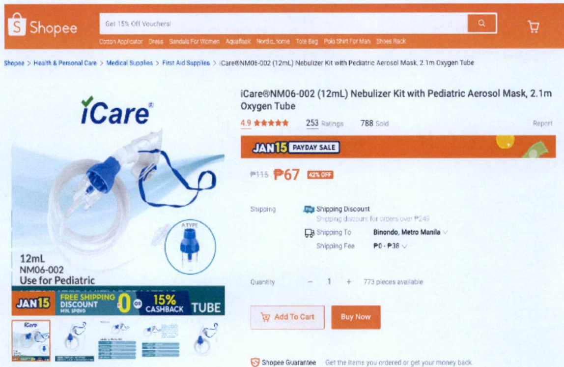
Figure 1. Unregistered iCare® Nebulizer Kit with Pediatric Aerosol Mask (NM06-002-002, 12mL) advertised at Shopee.ph

The Food and Drug Administration (FDA) warns all healthcare professionals and the general public NOT TO PURCHASE AND USE the unregistered medical device product: