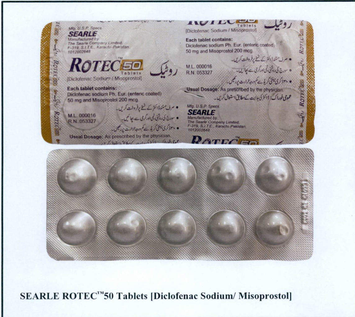
SEARLE ROTEC™50 Tablets [Diclofenac Sodium/ Misoprostol]

The Food and Drug Administration (FDA) advises the public against the purchase and use of the unregistered drug product: