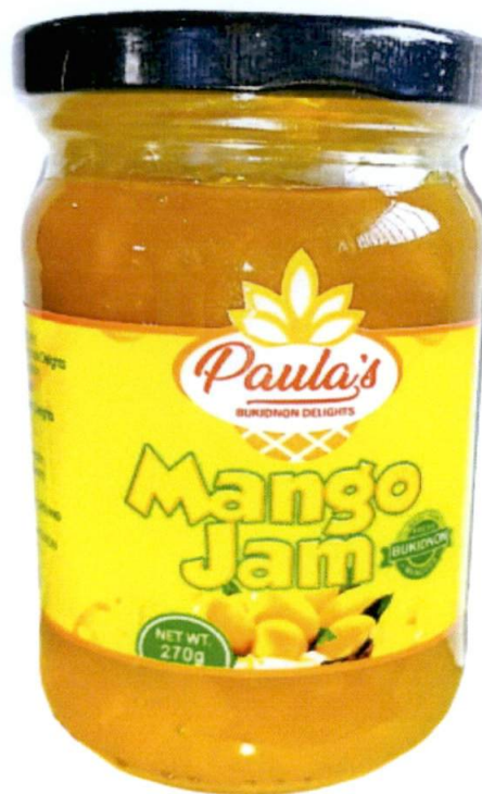
Figure 1. Unregistered PAULA'S BUKIDNON DELIGHTS Mango Jam

The Food and Drug Administration (FDA) warns all healthcare professionals and the general public NOT TO PURCHASE AND CONSUME the unregistered food product: