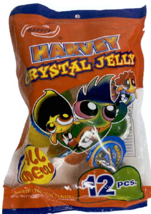
Figure 1. Unregistered HARVEY Crystal Jelly Assorted Tropical Flavors

The Food and Drug Administration (FDA) warns all healthcare professionals and the general public NOT TO PURCHASE AND CONSUME the unregistered food product: