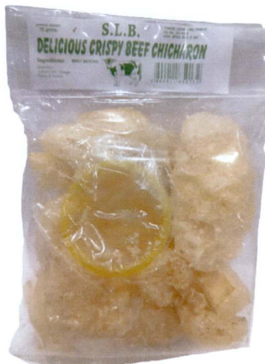
Figure 1. Unregistered S.L.B. Delicious Crispy Beef Chicharon

The Food and Drug Administration (FDA) warns all healthcare professionals and the general public NOT TO PURCHASE AND CONSUME the unregistered food product: