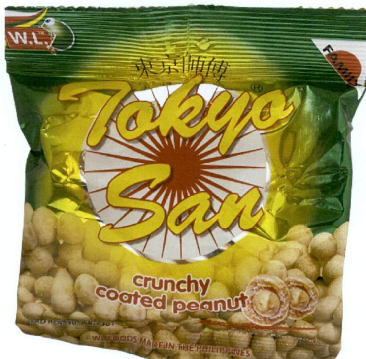
Figure 1. Unregistered W.L. TOKYOSAN Crunchy Coated Peanut

The Food and Drug Administration (FDA) warns all healthcare professionals and the general public NOT TO PURCHASE AND CONSUME the unregistered food product: