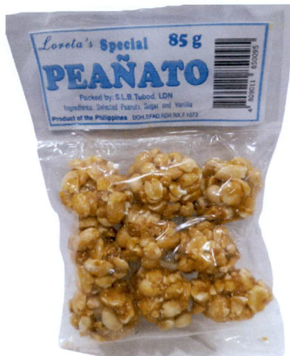
Figure 1. Unregistered LORETA'S SPECIAL Peañaato

The Food and Drug Administration (FDA) warns all healthcare professionals and the general public NOT TO PURCHASE AND CONSUME the unregistered food product: