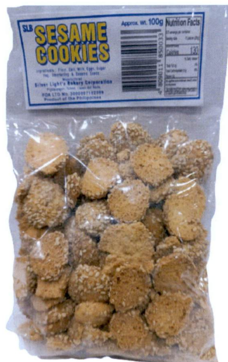
Figure 1. Unregistered SLB Sesame Cookies

The Food and Drug Administration (FDA) warns all healthcare professionals and the general public NOT TO PURCHASE AND CONSUME the unregistered food product: