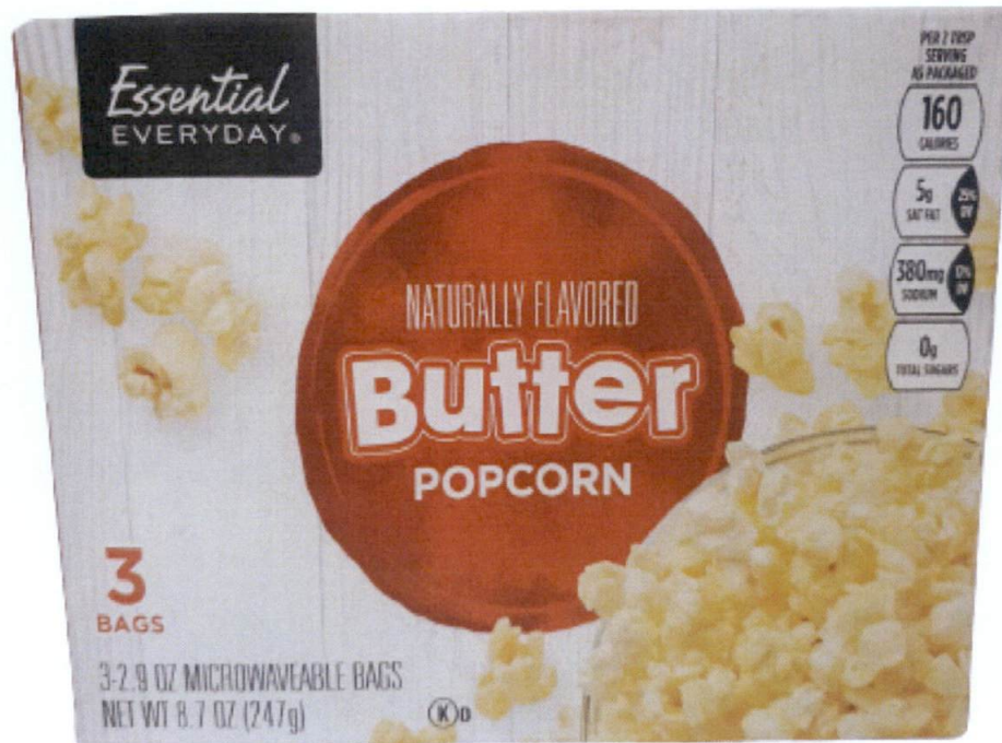
Figure 1. Unregistered ESSENTIAL EVERYDAY Naturally Flavored Butter Popcorn

The Food and Drug Administration (FDA) warns all healthcare professionals and the general public NOT TO PURCHASE AND CONSUME the unregistered food product: