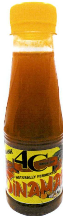
Figure 1. Unregistered 4C Organic Naturally Fermented Sinamak

The Food and Drug Administration (FDA) warns all healthcare professionals and the general public NOT TO PURCHASE AND CONSUME the unregistered food product: