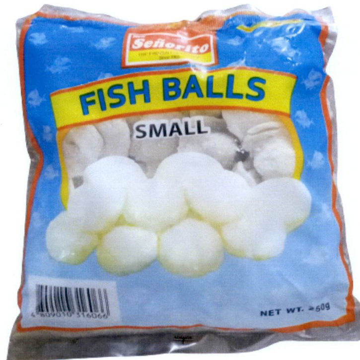
Figure 1. Unregistered NEW SENORITO THE FROZEN FOOD CORP. Fish Balls Small

The Food and Drug Administration (FDA) warns all healthcare professionals and the general public NOT TO PURCHASE AND CONSUME the unregistered food product: