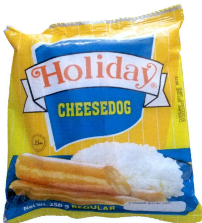
Figure 1. Unregistered HOLIDAY Cheesedog Regular

The Food and Drug Administration (FDA) warns all healthcare professionals and the general public NOT TO PURCHASE AND CONSUME the unregistered food product: