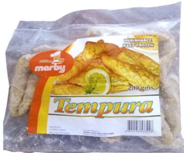
Figure 1. Unregistered MARBY Tempura

The Food and Drug Administration (FDA) warns all healthcare professionals and the general public NOT TO PURCHASE AND CONSUME the unregistered food product: