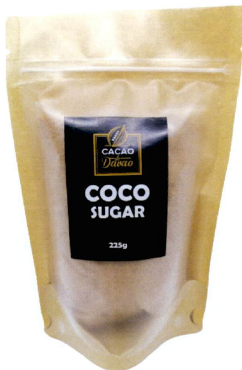
Figure 1. Unregistered CACAO DE DAVAO Coco Sugar

The Food and Drug Administration (FDA) warns all healthcare professionals and the general public NOT TO PURCHASE AND CONSUME the unregistered food product: