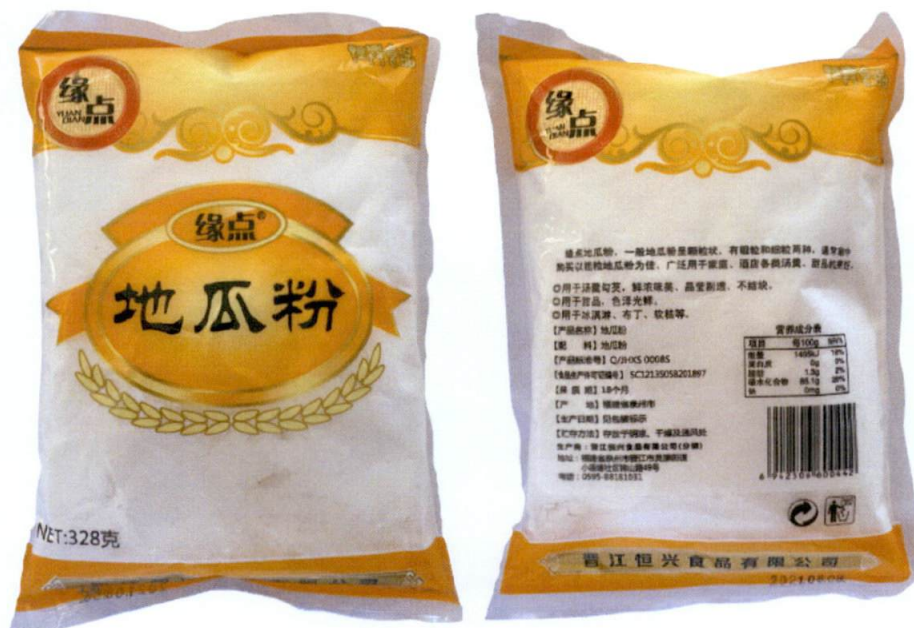
Figure 1. Unregistered YUAN DIAN Powder-like Food Product in Orange and Clear Packaging (In Foreign Language)

The Food and Drug Administration (FDA) warns all healthcare professionals and the general public NOT TO PURCHASE AND CONSUME the unregistered food product: