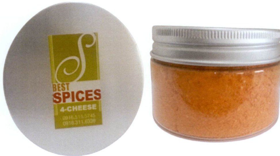
Figure 1. Unregistered BEST SPICES 4-Cheese

The Food and Drug Administration (FDA) warns all healthcare professionals and the general public NOT TO PURCHASE AND CONSUME the unregistered food product: