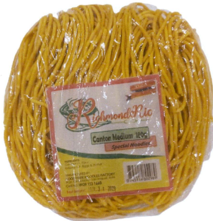
Figure 1. Unregistered RICHMOND RIC Canton Medium Special Noodles

The Food and Drug Administration (FDA) warns all healthcare professionals and the general public NOT TO PURCHASE AND CONSUME the unregistered food product: