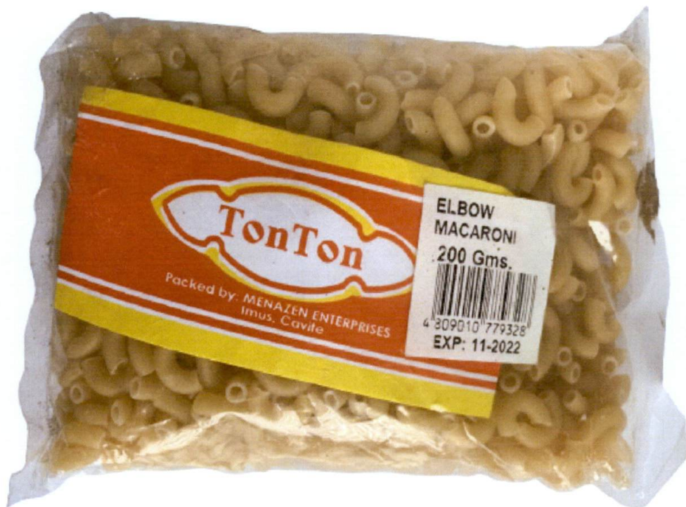
Figure 1. Unregistered TONTON Elbow Macaroni

The Food and Drug Administration (FDA) warns all healthcare professionals and the general public NOT TO PURCHASE AND CONSUME the unregistered food product: