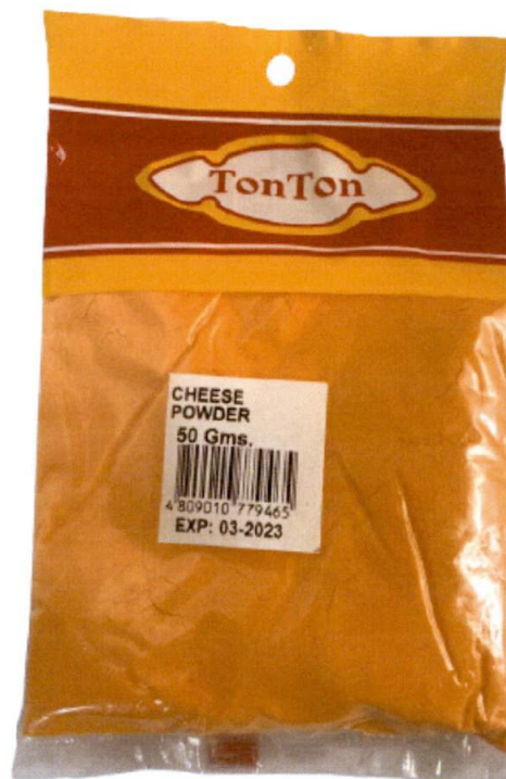
Figure 1. Unregistered TONTON Cheese Powder

The Food and Drug Administration (FDA) warns all healthcare professionals and the general public NOT TO PURCHASE AND CONSUME the unregistered food product: