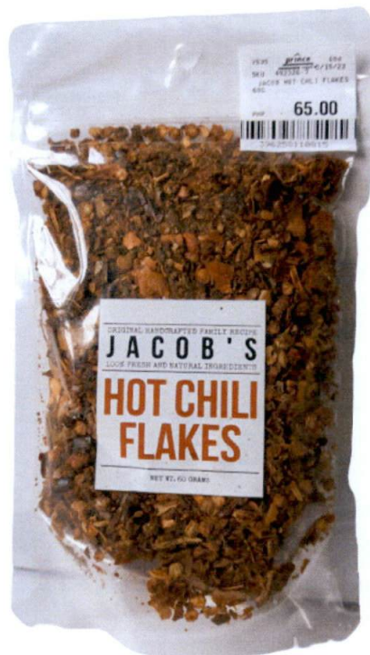
Figure 1. Unregistered JACOB'S Hot Chili Flakes

The Food and Drug Administration (FDA) warns all healthcare professionals and the general public NOT TO PURCHASE AND CONSUME the unregistered food product: