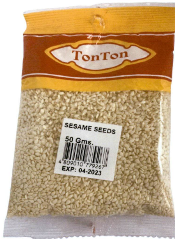
Figure 1. Unregistered TONTON Sesame Seeds

The Food and Drug Administration (FDA) warns all healthcare professionals and the general public NOT TO PURCHASE AND CONSUME the unregistered food product: