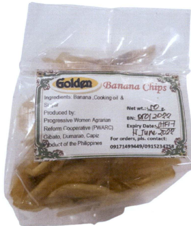
Figure 1. Unregistered GOLDEN Banana Chips

The Food and Drug Administration (FDA) warns all healthcare professionals and the general public NOT TO PURCHASE AND CONSUME the unregistered food product: