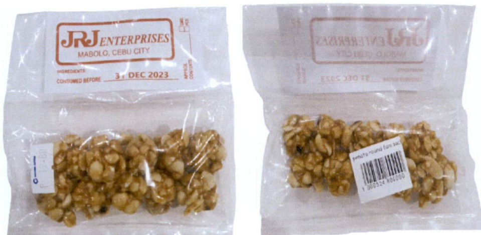
Figure 1. Unregistered JRJ ENTERPRISES Penato Round Fam Pack

The Food and Drug Administration (FDA) warns all healthcare professionals and the general public NOT TO PURCHASE AND CONSUME the unregistered food product: