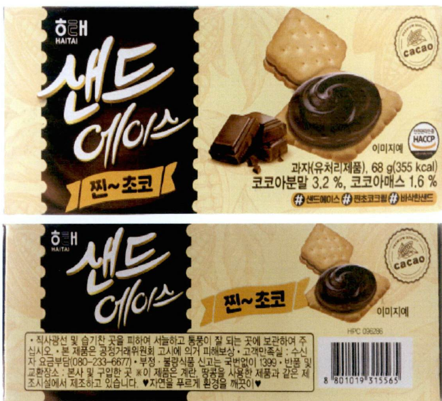
Figure 1. Unregistered HAITAI Biscuit Food Product with Chocolate Image in Brown Packaging (In Foreign Language)

The Food and Drug Administration (FDA) warns all healthcare professionals and the general public NOT TO PURCHASE AND CONSUME the unregistered food product: