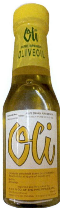
Figure 1. Unregistered OLI Pure Spanish Olive Oil

The Food and Drug Administration (FDA) warns all healthcare professionals and the general public NOT TO PURCHASE AND CONSUME the unregistered food product: