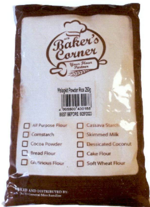
Figure 1. Unregistered ACD BAKER'S CORNER Malagkit Powder Rice

The Food and Drug Administration (FDA) warns all healthcare professionals and the general public NOT TO PURCHASE AND CONSUME the unregistered food product: