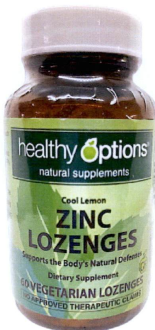
Figure 1. Unregistered HEALTHY OPTIONS Cool Lemon Zinc Lozenges Dietary Supplement

The Food and Drug Administration (FDA) warns all healthcare professionals and the general public NOT TO PURCHASE AND CONSUME the unregistered food supplement: