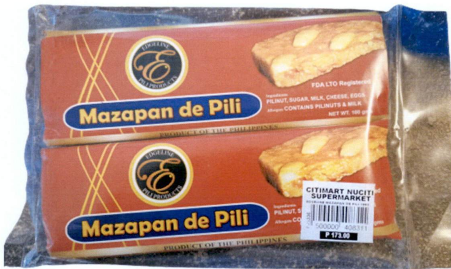
Figure 1. Unregistered EDGELINE PILI PRODUCTS Mazapan de Pili

The Food and Drug Administration (FDA) warns all healthcare professionals and the general public NOT TO PURCHASE AND CONSUME the unregistered food product: