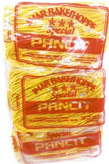
Figure 1. Unregistered IMAR BAKESHOPPE Special Pancit

The Food and Drug Administration (FDA) warns all healthcare professionals and the general public NOT TO PURCHASE AND CONSUME the unregistered food product: