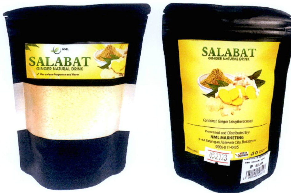
Figure 1. Unregistered NML Salabat Ginger Natural Drink

The Food and Drug Administration (FDA) warns all healthcare professionals and the general public NOT TO PURCHASE AND CONSUME the unregistered food product: