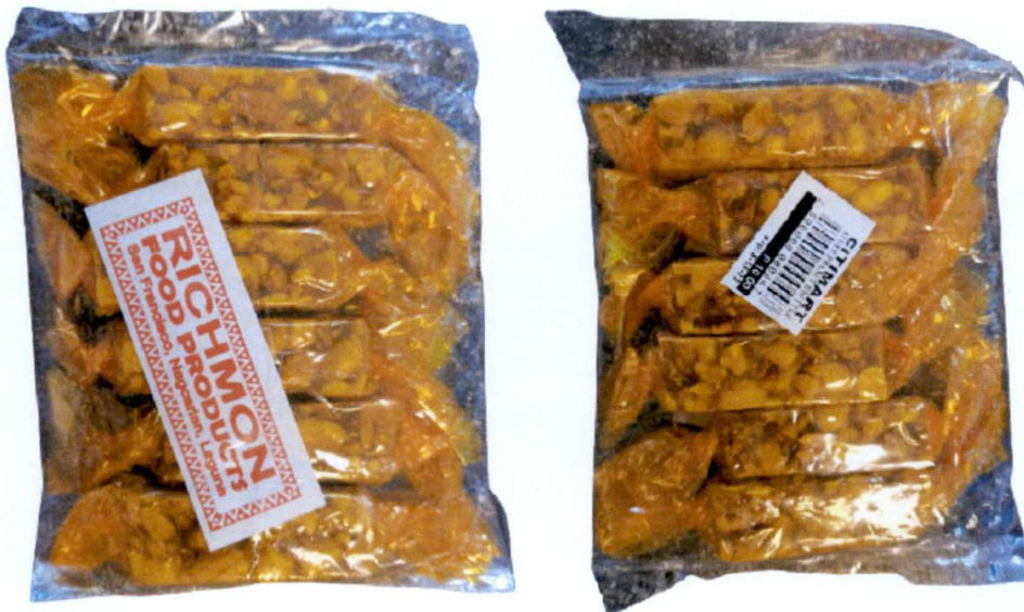
Figure 1. Unregistered RICHMON FOOD PRODUCTS Aida'N Peanut Brittle

The Food and Drug Administration (FDA) warns all healthcare professionals and the general public NOT TO PURCHASE AND CONSUME the unregistered food product: