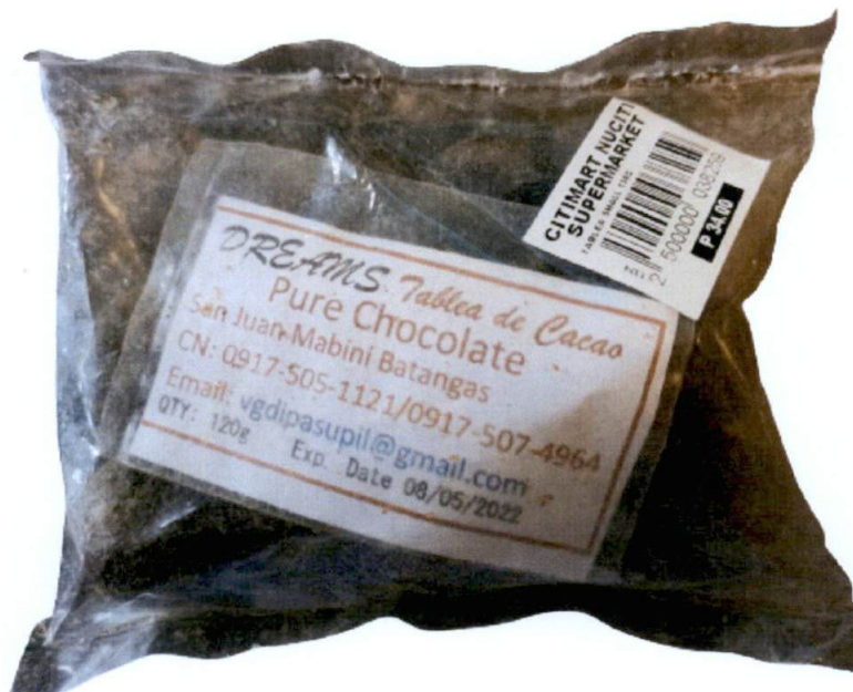
Figure 1. Unregistered DREAMS Tablea de Cacao Pure Chocolate

The Food and Drug Administration (FDA) warns all healthcare professionals and the general public NOT TO PURCHASE AND CONSUME the unregistered food product: