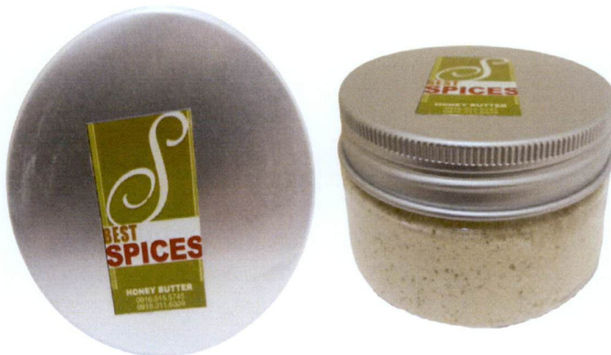
Figure 1. Unregistered BEST SPICES Honey Butter

The Food and Drug Administration (FDA) warns all healthcare professionals and the general public NOT TO PURCHASE AND CONSUME the unregistered food product: