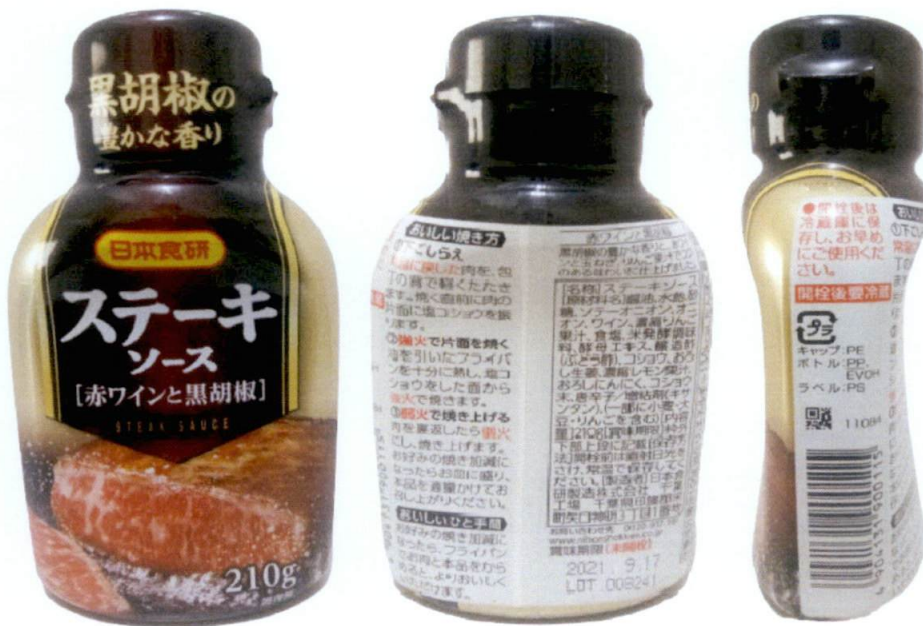
Figure 1. Unregistered NIHON SHOKKEN Steak Sauce (In Foreign Language)

The Food and Drug Administration (FDA) warns all healthcare professionals and the general public NOT TO PURCHASE AND CONSUME the unregistered food product: