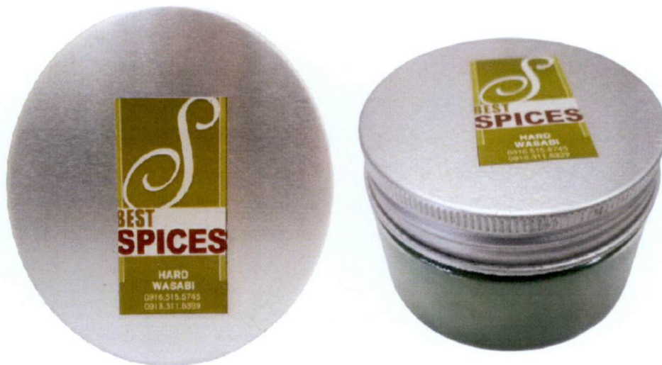
Figure 1. Unregistered BEST SPICES Hard Wasabi

The Food and Drug Administration (FDA) warns all healthcare professionals and the general public NOT TO PURCHASE AND CONSUME the unregistered food product: