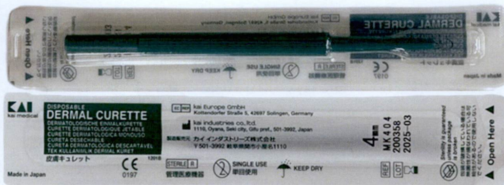
Figure 2. Unregistered Disposable Dermal Curette

The FDA verified through post-marketing surveillance that the above-mentioned medical device products are not registered, and no corresponding Product Registration Certificate have been issued. Pursuant to the Republic Act No. 9711, otherwise known as the “Food and Drug Administration Act of 2009”, the manufacture, importation, exportation, sale, offering for sale, distribution, transfer, non-consumer use, promotion, advertising, or sponsorship of health products without the proper authorization is prohibited.