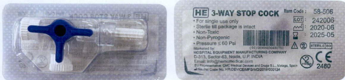
Figure 1. Unregistered HE 3-Way Stop Cock

The Food and Drug Administration (FDA) warns all healthcare professionals and the general public NOT TO PURCHASE AND USE the following unregistered medical device products: