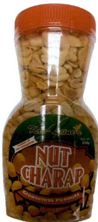
Figure 1. Unregistered KAT-LEINE'S Nut Charap Greaseless Peanuts

The Food and Drug Administration (FDA) warns all healthcare professionals and the general public NOT TO PURCHASE AND CONSUME the unregistered food product: