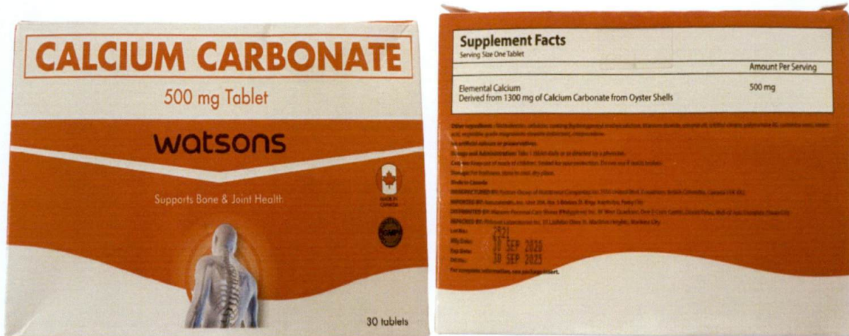
Figure 1. Unregistered WATSONS Calcium Carbonate 500 mg

The Food and Drug Administration (FDA) warns all healthcare professionals and the general public NOT TO PURCHASE AND CONSUME the unregistered food supplement: