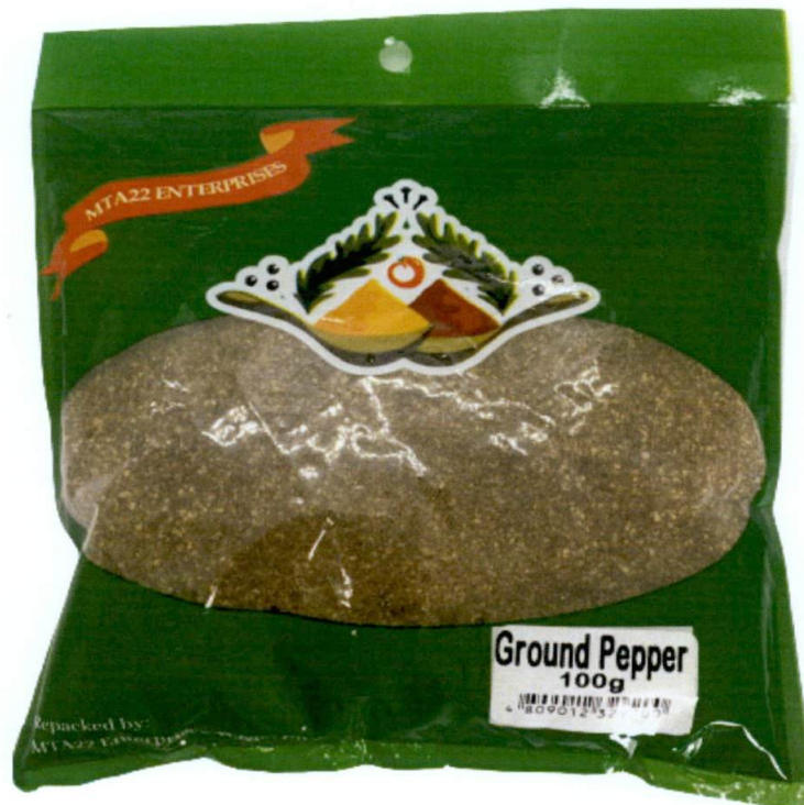
Figure 1. Unregistered MTA22 ENTERPRISES Ground Pepper

The Food and Drug Administration (FDA) warns all healthcare professionals and the general public NOT TO PURCHASE AND CONSUME the unregistered food product: