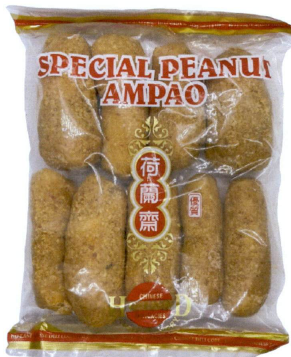
Figure 1. Unregistered HO-LAND CHINESE DELICACIES Special Peanut Ampao

The Food and Drug Administration (FDA) warns all healthcare professionals and the general public NOT TO PURCHASE AND CONSUME the unregistered food product: